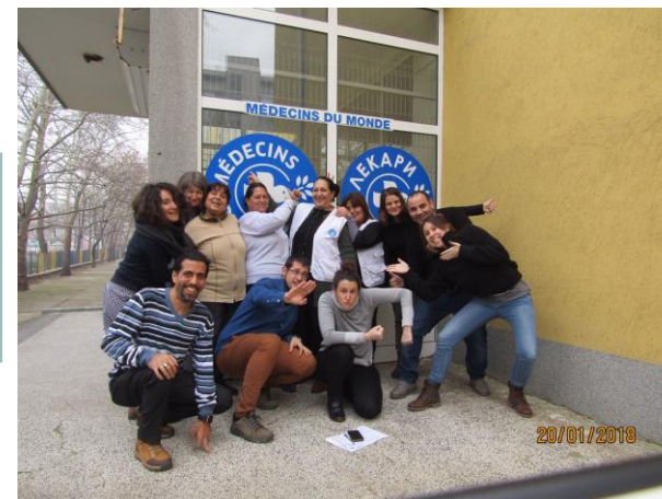
Bulgarian team during HQ visit