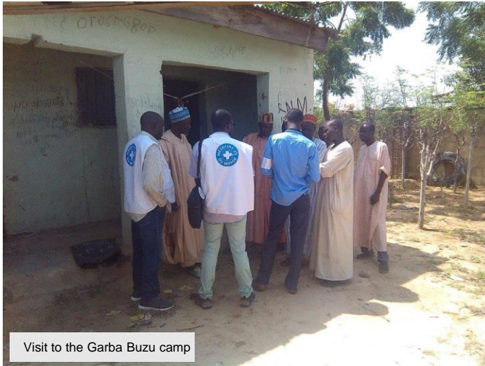
Visit to the Garba Buzu camp