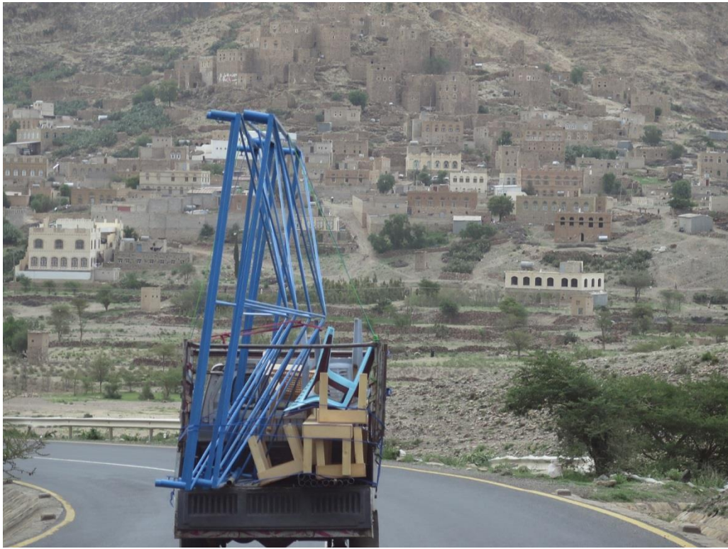
Transporting parts of the MdM mobile clinic on the roads of Sana'a in order to set up our activities: access to primary health care, including mental health and care and treatment of the acutely malnourished in the governorates of Sana'a and Ibb.

600 health centres have been damaged or destroyed by bombing